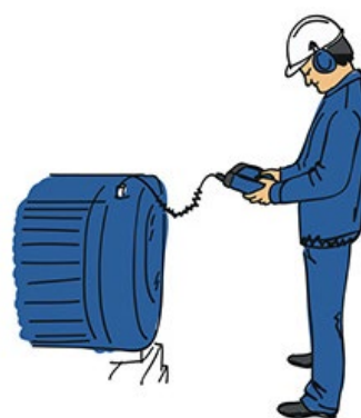
Figure 1. Vibration diagnostics [Adash 2019]

The headstock inspection method is called vibration diagnostics. This method can reveal the condition of the bearings for the spindle bearing, the lubrication status and the total degree of vibration. Vibration diagnostics measures the spindle drives and can detect initial bearing damage. Milling and horizontal centers may have a problem with tool clamping by checking the clamping force. The results of this measurement are compared with the values of the manufacturer. The tapered spindle cavity can be checked with a color decal gauge. This test reveals, for example, point corrosion at the conical cavity. [Vavrac 2010]