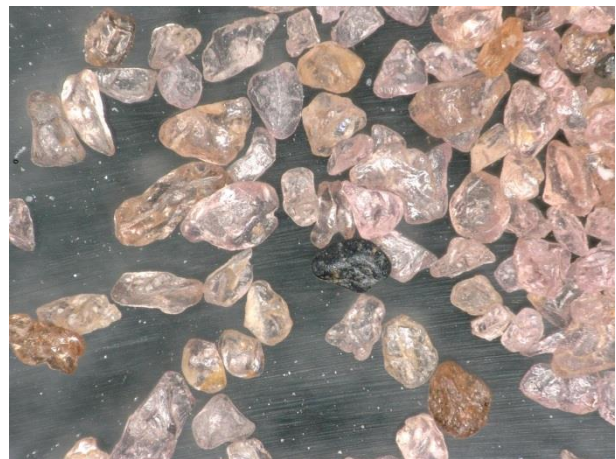
Figure 2. Grains of Australian garnet (mean grain size of 288 \mu m )

Australian garnet is a natural mineral with main proportions of almandine ( Fe^{2+}_3Al_2[SiO_4]_3 ) and pyrope ( Mg_3Al_2[SiO_4]_3 ). Almandine is an iron-aluminum garnet and pyrope is a magnesium-aluminum garnet. Pure forms of almandine and pyrope are rare in nature and most specimens are compositions of both minerals. Industrial abrasive made from almandine garnet is the prevalent abrasive material used in the AWJ cutting [Martinec 2002a]. Fig. 2 shows the Australian garnet used in our experiments.