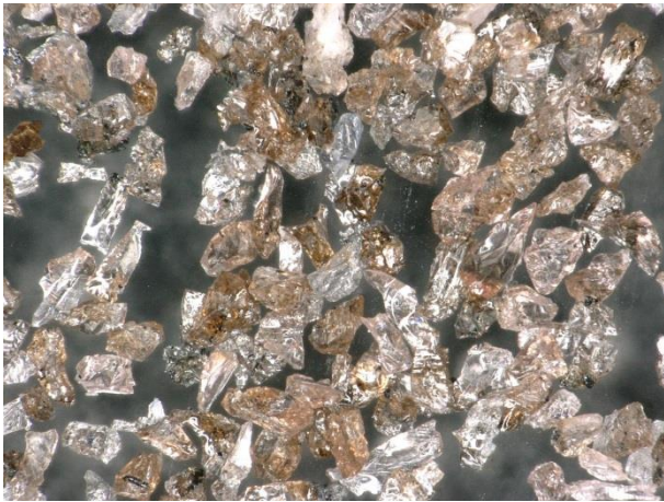
Figure 3. Grains of artificial brown corundum (mean grain size of 226 \mu\text{m} )

All tested abrasives were of 80 MESH grain size according to manufacturers' specifications. Laser particle size analysis was used to determine the exact grain size distribution of tested abrasives. Results of the analysis are presented in Fig. 4.