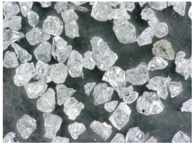
Figure 1. Grains of Norwegian olivine (mean grain size of 208 \mu m )

Olivine is a natural mineral with various proportions of forsterite ( Mg_2SiO_4 ) and fayalite ( Fe_2SiO_4 ) components. Forsterite-rich olivine is commonly used in metallurgy as moulding sand. It can also be used as an abrasive in the AWJ cutting and blasting [Martinec 2002b]. Fig. 1 shows the used Norwegian olivine.