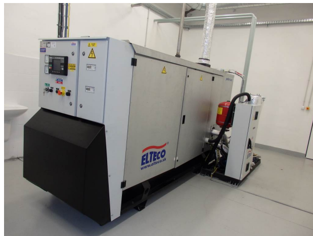
Figure 3. Cogeneration unit