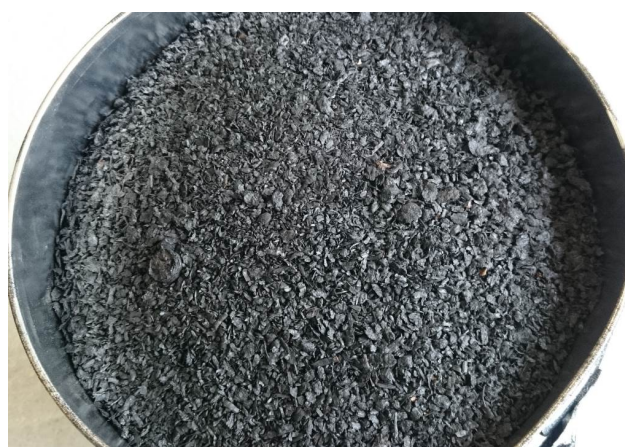
Figure 5. Output solid fuel – carbon

During the thermochemical conversion of agro-pellets the gasification process was very stable and generated very valuable synthesis gas that was burned in the engine of cogeneration unit; a solid component - pure carbon (Fig. 5) is also a high-quality fuel and generated reactor oil (Fig. 6) requires further distillation to achieve better quality parameters.