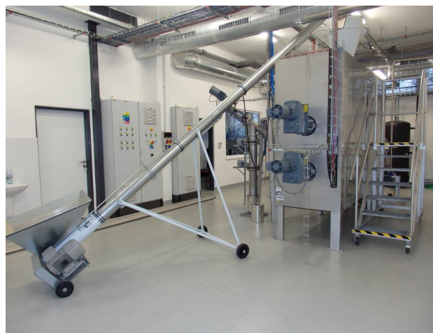
Figure 2. View of the gasification unit