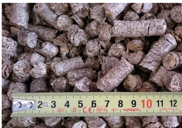
Figure 4. Input material - agro pellets

To document the functionality and efficiency of the technology of biomass thermochemical conversion we provide as an example the results of experiments with agro-pellets thermochemical conversion (Fig. 4) made of the mixture of agricultural biomass waste.