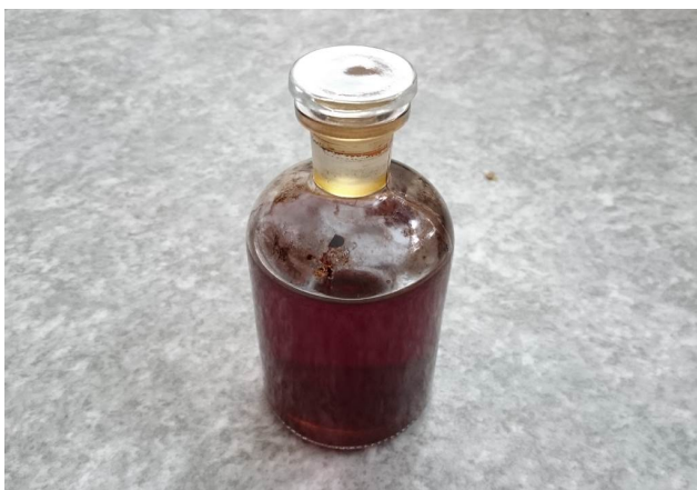
Figure 5. Output liquid component - reactor oil