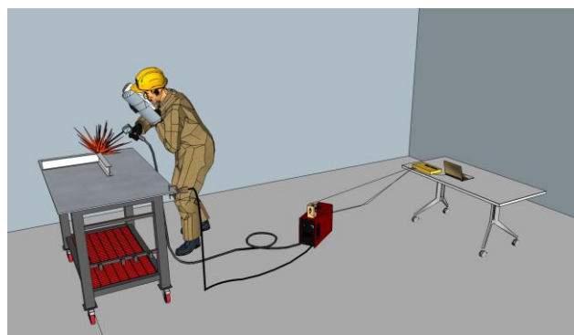
Figure 2. Situation scheme of measurement

During the measurement, the impact of various work operations during the welding process was also examined. We focused on the influence of power supply, and local values when operating the device in standby and operating mode.