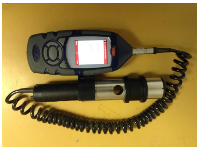
Figure 2. Passive aerosols monitor Microdust Pro CEL 712

The sensing head of hand-held monitor Microdust Pro CEL 712 (Microdust) is detachable cylindrical measurement wand. It is passive monitor that relies on ambient movement of the surrounding air. The dust enters and leaves through a hole in the side of the probe. It has measurement range of 0 mg.m -3 to 2 500 mg.m -3 . The instrument is factory calibrated using a method traceable back to isokinetic techniques using ISO 12103-1 A2 Fine test dust.