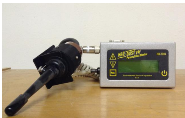
Figure 1. Personal real-time aerosols monitor HAZ-DUST IV™

Personal real-time dust monitor HAZ-DUST IV™ (HazDust) uses an internal adjustable pump to introduce aerosol into sampling inlet. It has measurement range of 0,01 mg.m -3 – 200 mg.m -3 for particle size range 0,1 μm to 100 μm and it is factory calibrated using NIST traceable SAE fine test dust. For the purpose of these measurements, an SKC GS-3 cyclone inlet with adaptor was used so that only respirable size fraction was sampled. Flow rate of internal sampling pump was set to operate at 2,75 L.min -1 using multi-purpose calibration jar.