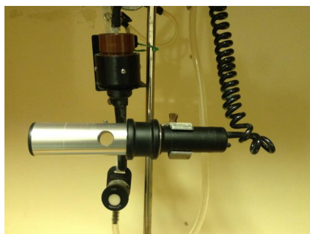
Figure 4. Detail of samplers position

Reference sampler (IOM, SKC Ltd.) was placed in close proximity to measuring probes to ensure that they were exposed to the same concentration of tested aerosol. IOM sampler was loaded with a 25 mm glass microfiber filter without binder (GF 50 025, Albet) and polyurethane foam insert (IOM Multidust sampler, SKC Ltd.). All the filters were conditioned and weighted using microbalance (XA 110, Radwag) before and after exposure. IOM sampler was connected to a pump (L-4, A. P. Buck), which was set to operate at 2 L.min -1 using a primary flow meter (Defender 510, MesaLabs, Butler).