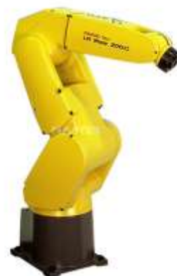
Figure 1. Prototype – robot-manipulator “FANUC LR Mate 200iC”

The robot-manipulator is run by the R30iA controller [Kennedy 2017]. The robot represents as a closed mechanical construction with mechanisms of engines and electronic components are located inside.