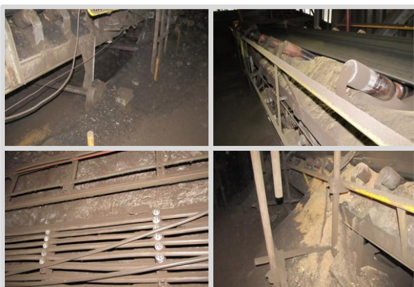
Figure 4. Contaminated area of belt conveyor and electrical wiring

Problems with work organization, insufficiently cleaned technological equipment, which not only significantly increased the concentration of SA in the atmosphere but also exposed the whole workplace, were also found during the measurements. If such conditions lasted for a certain period, it could lead to an explosive atmosphere in the plant.