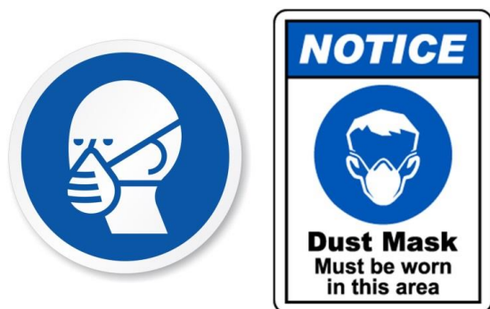
Fig. 6 Proposed signs

In all visible areas of the workplace where there is a risk of exposure to SA, hang a sign of respiratory system protection, maybe together with the notice "Use a dust respirator" as shown in Fig. 6.