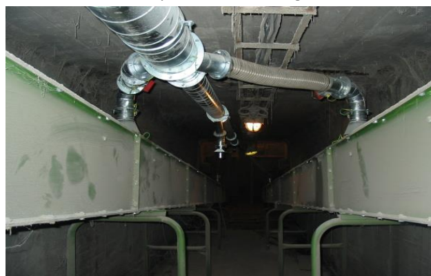
Fig. 5 Conveyor with SA dust collection system

To significantly reduce the concentration of SA in the workplace, it is necessary to design protection directly on the largest SA sources, i.e. on conveyors and spilling stations. The installation of covers and the SA dust collection system for each conveyor belt is a suitable solution for the workplace. Dust collection system and filtration equipment are designed to extract dust as closely as possible to prevent it from spreading and settling in the surrounding area. A covered belt conveyor with a dust collection system is shown in Fig. 5.