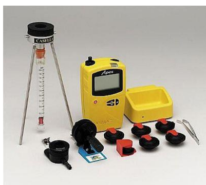
Figure 3. Sizes of particles present in the atmosphere

A personal sampling pump (Fig. 3) is a basic measuring instrument used in the gravimetric measurement of SA concentration in the working atmosphere. A personal sampling pump must be capable of continuous operation for eight hours per battery charge. Before measuring, the head with the prepared filter type is clamped on the pump [Kelemen 2004].